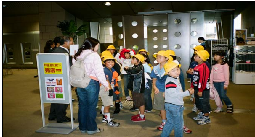
Figure 3. School children participate in earthquake education activities at the Honjo Life Safety Learning Center in Tokyo.

Demonstration”, and an “Earthquake Shaking Table”, all engaging experiences eliciting powerful physical and emotional responses.