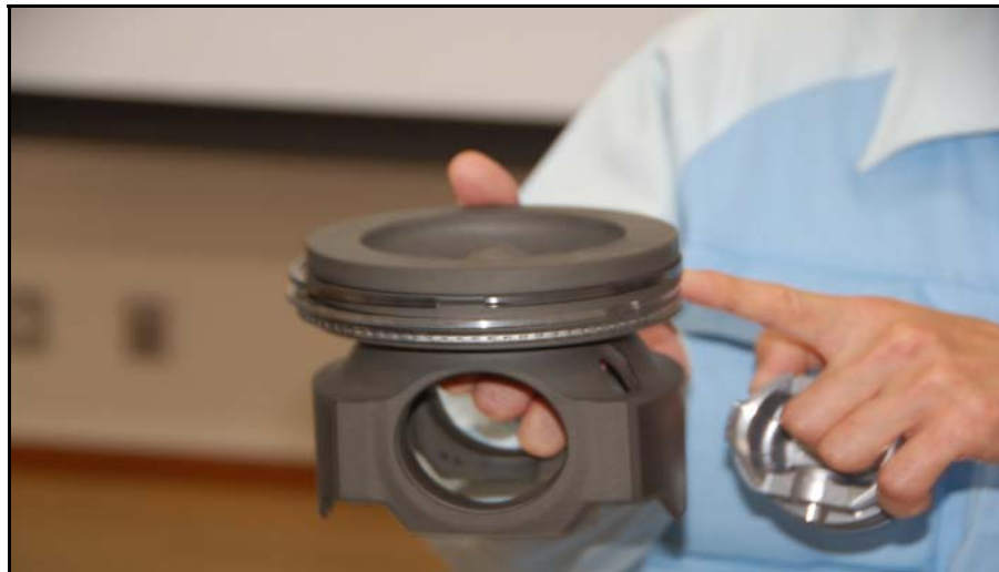
Figure 2. Riken Corporation official pointing to a piston ring. Riken's Kashiwazaki plant was shut down for one week resulting in delayed production of 130,000 automobiles.

The Riken Corporation Plant in Kashiwazaki manufactures about half of the piston rings used by the entire automobile industry in Japan. Riken has 1,741 employees who produce 31 million piston rings per month in addition to 580 million compressor rings per month. The nine satellite companies in the region that are Riken's suppliers have another 1,400 employees. Although Riken was on holiday hours at the time of the earthquake, 45 employees were injured, 13 of whom were working. Another four workers were injured during recovery efforts.