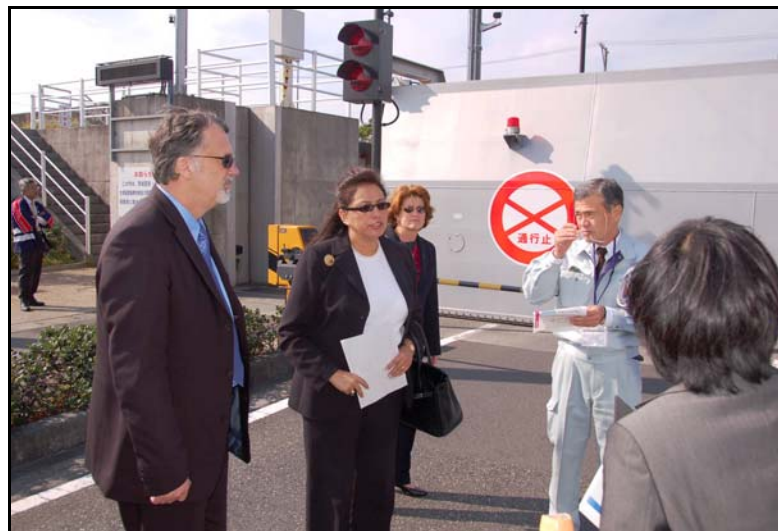
Figure 5. A demonstration on the operation of the moveable tsunami gates is led by a member of the Yaizu City Fire and Disaster Prevention Department. To the left and behind the traffic control device is a seismic intensity measuring device.

The prefecture has taken significant steps to reduce the tsunami risk by implementing tsunami countermeasures for the safety of its residents, thus protecting lives and economic stability. The prefecture built a system of tsunami walls that include 8 moveable gates along the inland perimeter of Yaizu Port, the gates are operated automatically in the event of a tsunami. Alarms sound before the gates are activated. The prefecture has also constructed vertical evacuation platforms on the seaside portion of the tsunami walls and gates in the event that people and workers in the ports are unable to evacuate inland before damaging waters arrive. The tsunami platforms can each accommodate over 100 people.