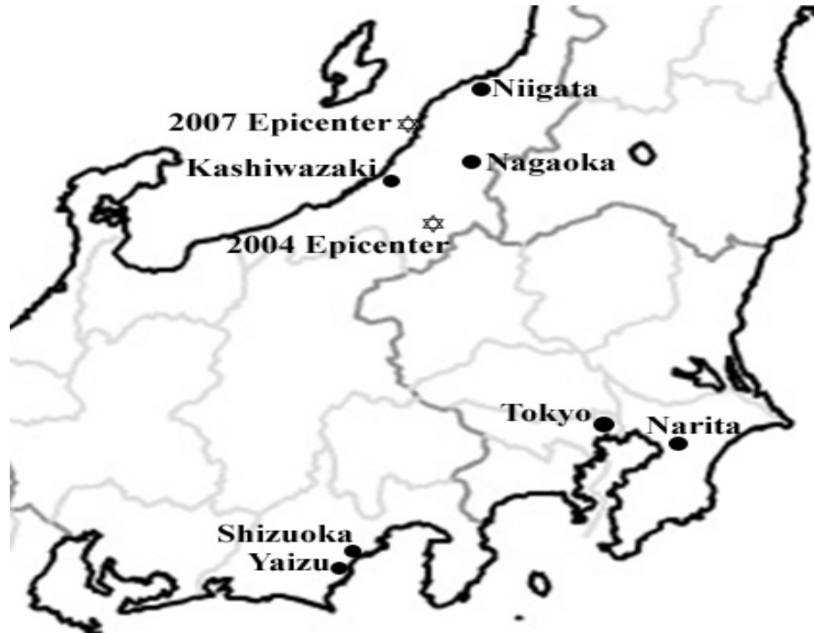
Figure 1. The travel team visited Tokyo, Niigata, Nagaoka, Kashiwazaki, Shizuoka, and Yaizu.

Table 1 provides a comparison among recent and forecasted earthquakes in Japan and California. While the 2004 and 2007 Niigata earthquakes released similar amounts of energy, their losses were dramatically different. The earthquakes with higher losses occurred in regions with larger populations. In the case of the 1995 Kobe earthquake, approximately half of the lives were lost in the ensuing fires.