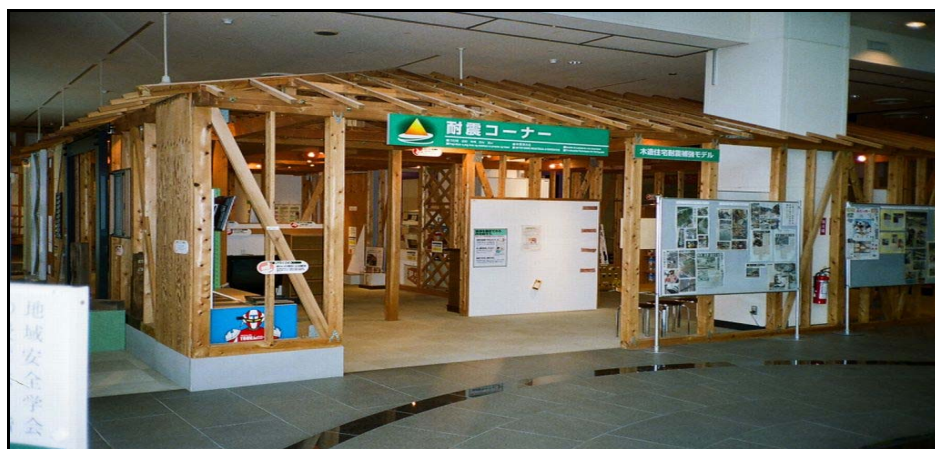
Figure 4. At the Shizuoka Disaster Preparedness Center, a full scale model home is constructed. Note the bracing and non-structural items used to educate the public on mitigation actions and preparedness.

The educational approach of these centers combines emotional engagement with practical information that demonstrates what needs to be done and how to do it. The centers offer guided tours with full-time docents and staff dedicated to conducting the tours to fully achieve their respective center objectives. It should be noted that these centers are funded by the Tokyo Metropolitan Government and the Shizuoka Prefectural government and represents a major commitment to reduce earthquake risk. Furthermore, the entire country conducts an earthquake preparedness drill each year on September 1 st .