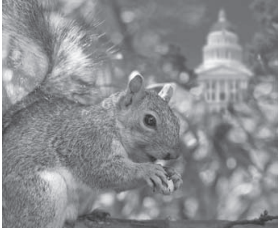
Capitol Park in Sacramento is popular with squirrels as well as legislators, lobbyists and locally elected officials.

Special session urgency bills require a two-thirds vote for passage. If signed by the governor, such bills go into effect immediately upon signature. Non-urgency special session bills, which require a majority vote for passage, go into effect on